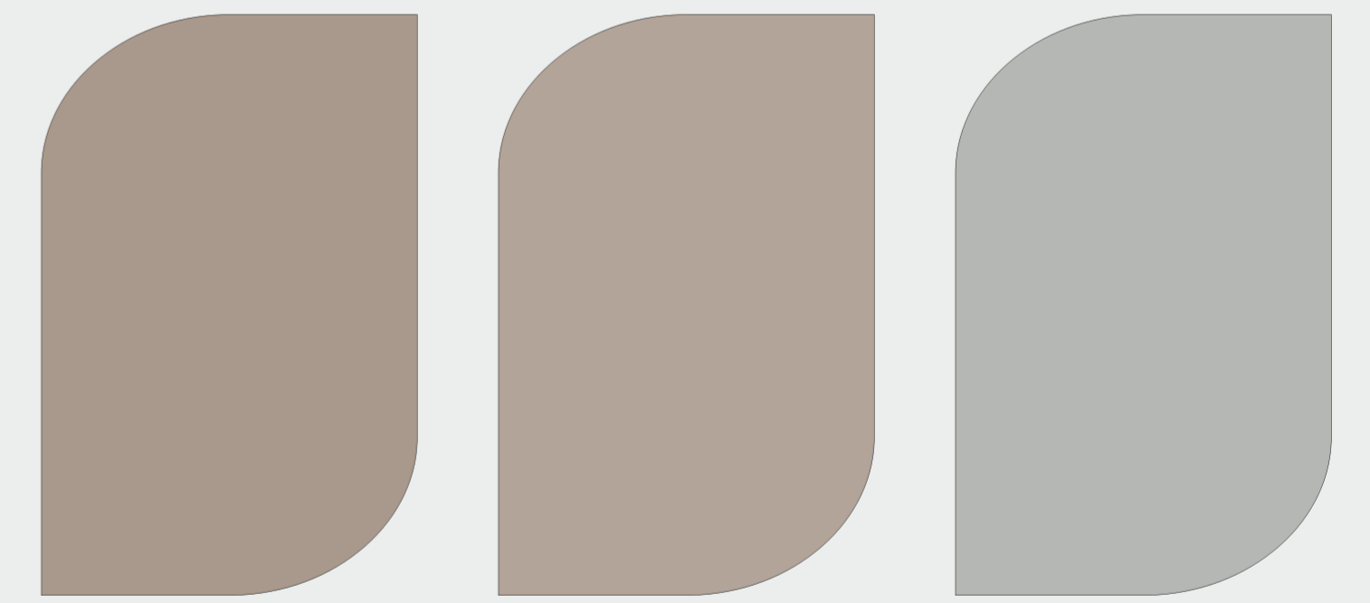
NSMT-19 NSMT-20 NSMT-21