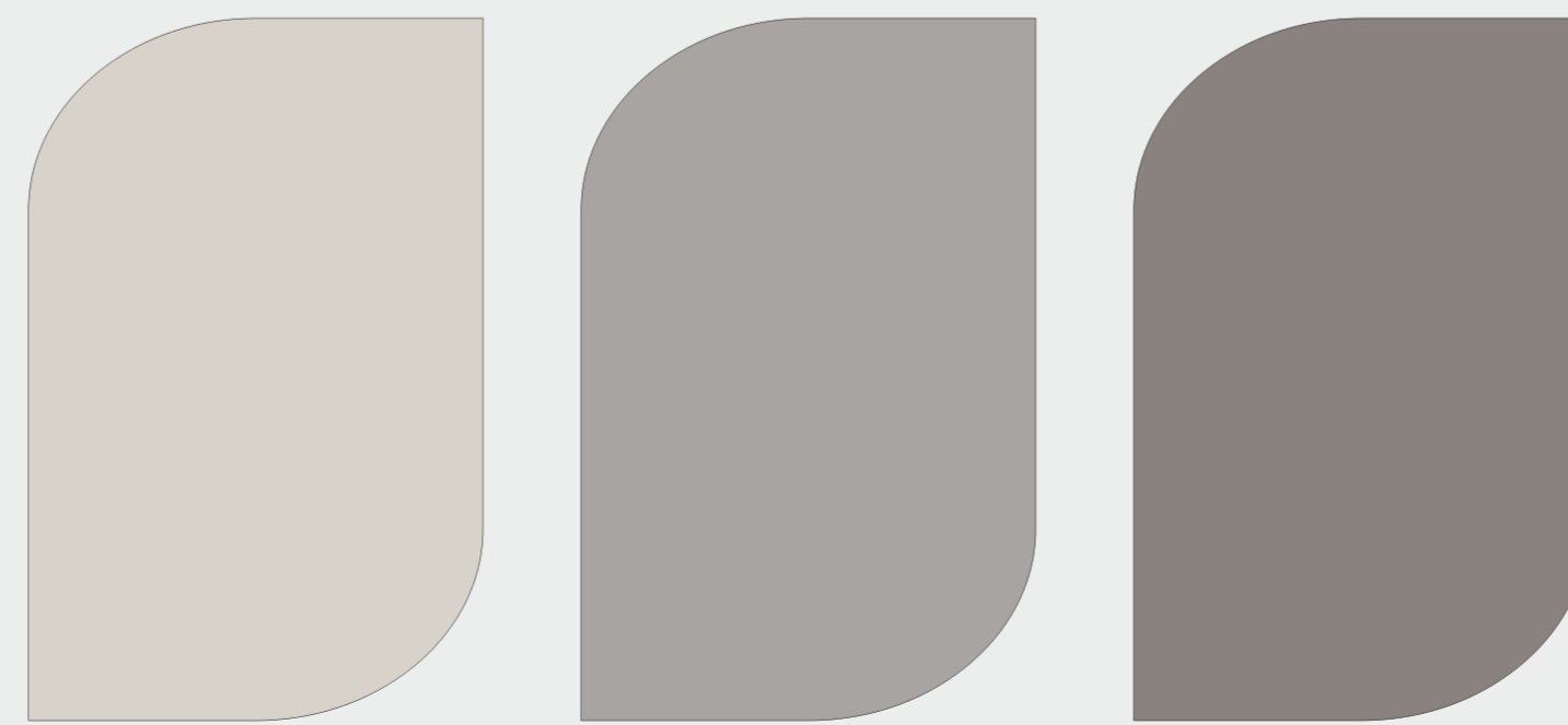
NSMT-16 NSMT-17 NSMT-18