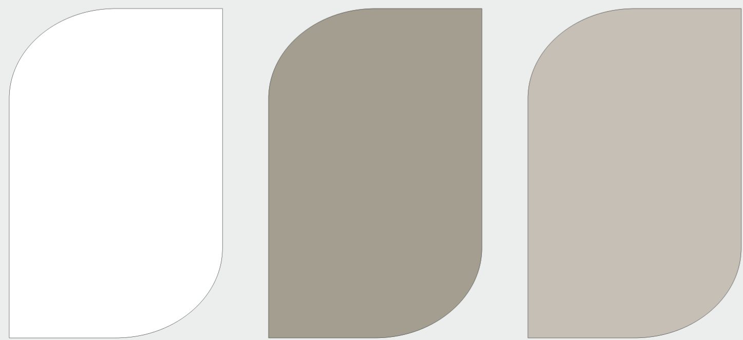
NSMT-10 NSMT-11 NSMT-12