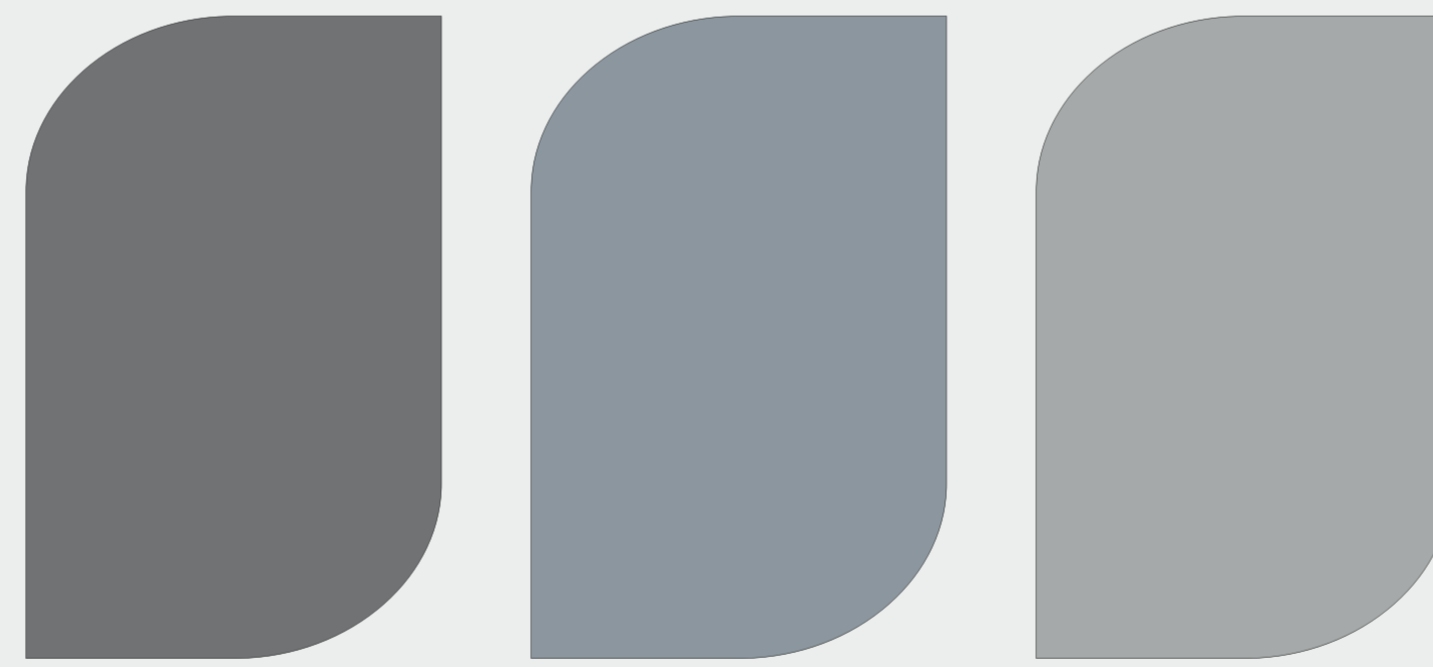
NSMT-13 NSMT-14 NSMT-15