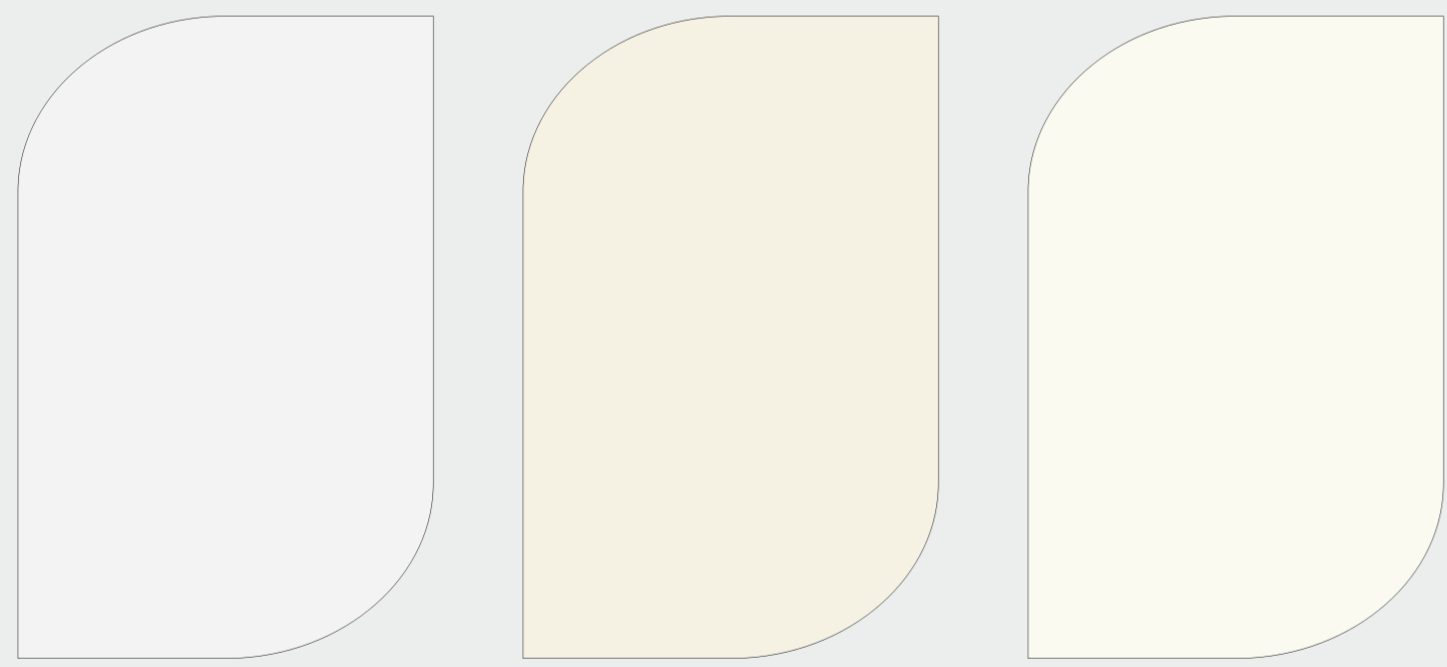
NSMT-07 NSMT-08 NSMT-09