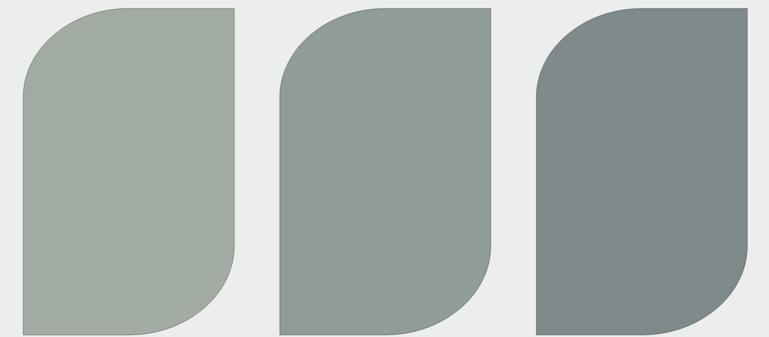
NSMT-22 NSMT-23 NSMT-24